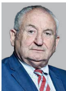
JOHN ANTHONY BIRD, Baron Bird, MBE Founder, Big Issue Invest and The BigIssue