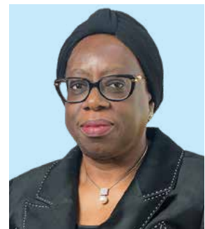
Kudirat Kekere-Ekun, CFR Justice of the Supreme Court of Nigeria.