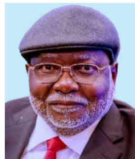
Olukayode Ariwoola, GCON Chief Justice of Nigeria.