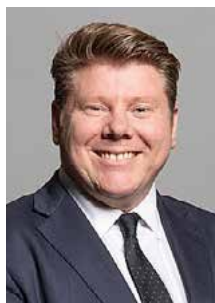
DEAN RUSSELL Member of Parliament of the United Kingdom