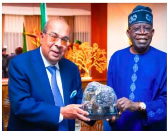
H.E President Bola Ahmed Tinubu with Chairman Prakash Hinduja in India (2023)