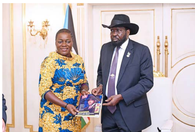
Presentation of FIN Magazine to H.E. Salva Kiir Mayarit, PPresident of the Republic of South Sudan.