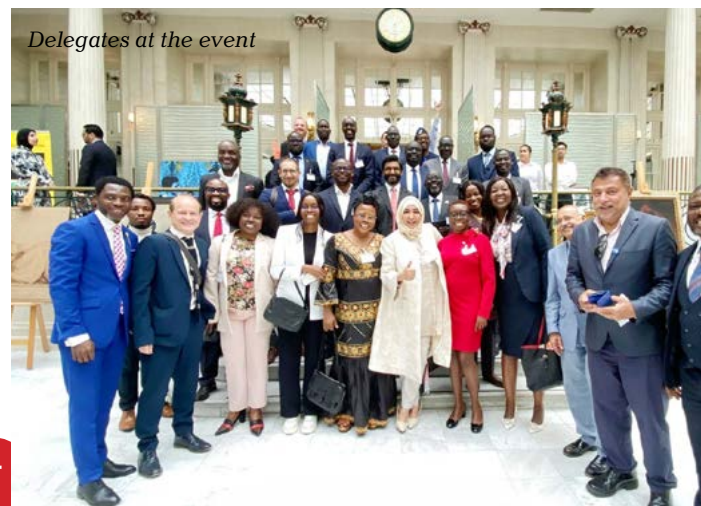
Delegates at the event