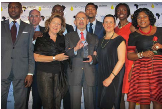
Dr Alirio Parra Former Minister of Petroleum, Venezuela and former OPEC President at the Petroleum Industry Award Vienna Austria 2014