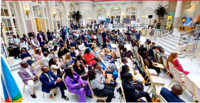
Delegates at the event