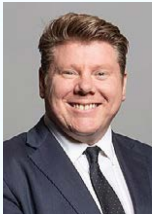
DEAN RUSSELL Member of Parliament of the United Kingdom

Habeeb Okunola Foundation has impacted the lives of no fewer than twenty thousand underserved Nigerians, with a deliberate focus on consolidating the delivery of the United Nations Sustainable Development Goals in Nigeria.